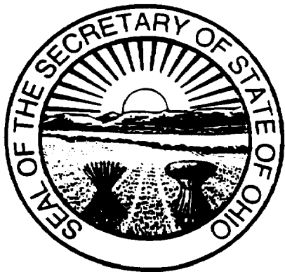
Bob Taft Secretary of State of Ohio