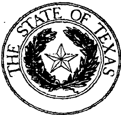
Alberto R. Gonzales Secretary of State