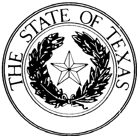
Alberto R. Gonzales Secretary of State