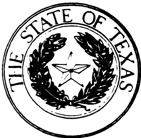
Alberto R. Gonzales Secretary of State