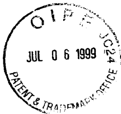
EXHIBIT B TO COLLATERAL ASSIGNMENT OF TRADEMARKS