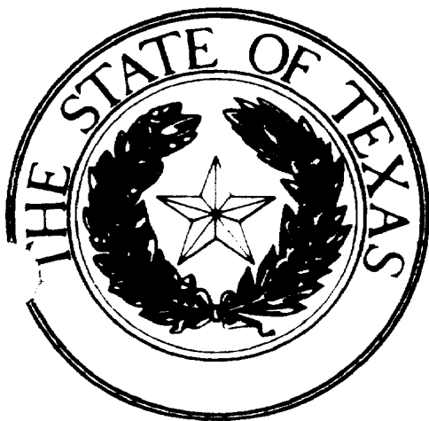
Alberto R. Gonzales Secretary of State