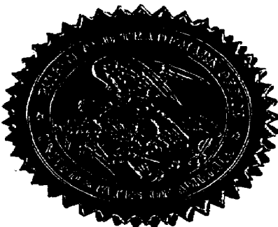
Commissioner of Patents and Trademarks