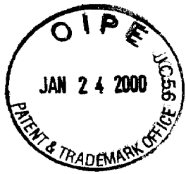
EXHIBIT A TO THE CONDITIONAL ASSIGNMENT OF AND SECURITY INTEREST IN TRADEMARK RIGHTS 4th QUARTER 1999