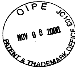
EXHIBIT A TRADEMARKS