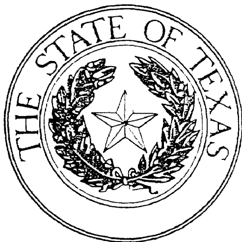
Alberto R. Gonzales