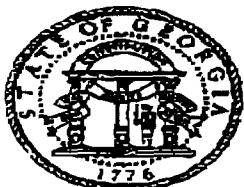
Cathy Cox Secretary of State

1 2 3 4 5 6 7 8 9 10 11 12 13 14 15 16 17 18 19 20 21 22 23 24 25 26 27 28 29 30 31 32 33 34 35 36 37 38 39 40 41 42 43 44 45 46 47 48 49 50