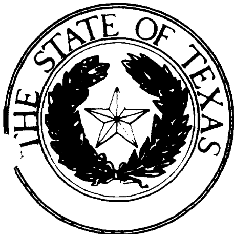
Alberto R. Gonzales Secretary of State