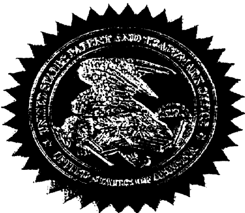
Director of the United States Patent and Trademark Office

This registration shall remain in force for TEN (10) years, unless terminated earlier as provided by law, and subject to compliance with the provisions of Section 8 of the Trademark Act of 1946, as Amended.