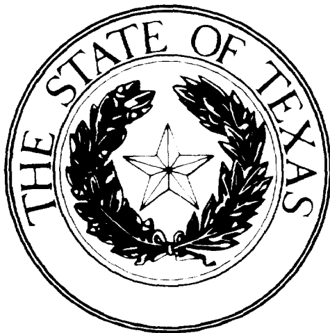
Henry Cuellar Secretary of State