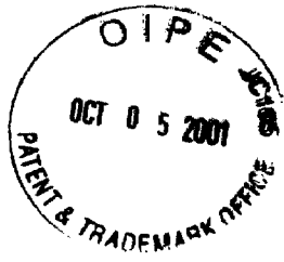
EXHIBIT D COPYRIGHTS