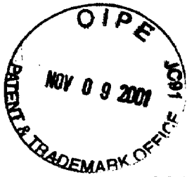
EXHIBIT TO ASSIGNMENT OF MARKS AND REGISTRATIONS