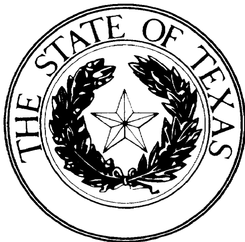
Henry Cuellar Secretary of State