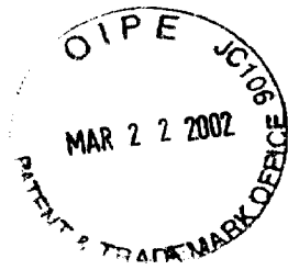
EXHIBIT A TRADEMARKS