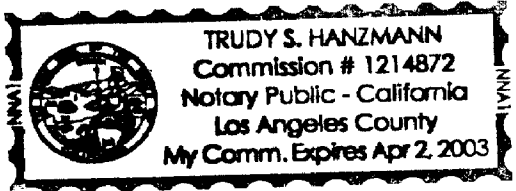
Place Notary Seal Above

to be the person(s) whose name(s) is/are subscribed to the within instrument and acknowledged to me that he/she/they executed the same in his/her/their authorized capacity(ies), and that by his/her/their signature(s) on the instrument the person(s), or the entity upon behalf of which the person(s) acted, executed the instrument.