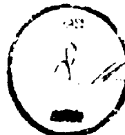
EXHIBIT A to MODIFICATION OF TRADEMARK MORTGAGE AGREEMENT Dated as of October 15, 1997

U.S. Trademark Registration Number Trademark Registration Date FOR FRANZIA WINERY L.P. 1,782,203 Bushberry July 13, 1993 513,080 Bravo (Stylized) August 2, 1989 1,456,760 California Colony September 8, 1987 1,449,988 Colony July 28, 1987 1,002,996 Colony & Design January 28, 1975 358,864 Franzia July 28, 1989 1,203,709 Franzia September 20, 1990 657,852 G & I (Stylized) January 28, 1978 1,096,225 Gambarelli and Davitto (Stylized) July 11, 1978 616,953 Marca Petri Pastoso (Stylized) November 29, 1975 1,313,767 North Coast Cellars January 8, 1985 74/047394 North Shore Cellars April 10, 1990 702,680 Parma August 9, 1980 1,532,297 Petri March 28, 1989 1,199,022 Petri and Design June 22, 1982 542,120 Petri (Stylized) May 8, 1991 1,484,506 Premium Colony (Stylized) April 12, 1988 817,501 Rhineskeller October 25, 1986