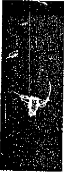
EXHIBIT B TO TRADEMARK COLLATERAL ASSIGNMENT AND SECURITY AGREEMENT