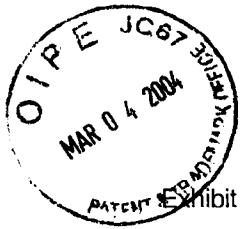
Exhibit "A" attached to that certain Intellectual Property Security Agreement.