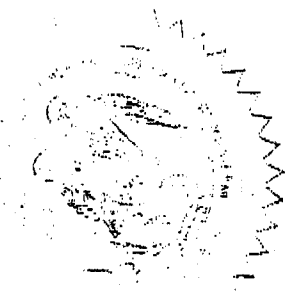
Director of the United States Patent and Trademark Office

This registration shall remain in force for TEN (10) years, unless terminated earlier as provided by law, and subject to compliance with the provisions of Section 8 of the Trademark Act of 1946, as Amended.