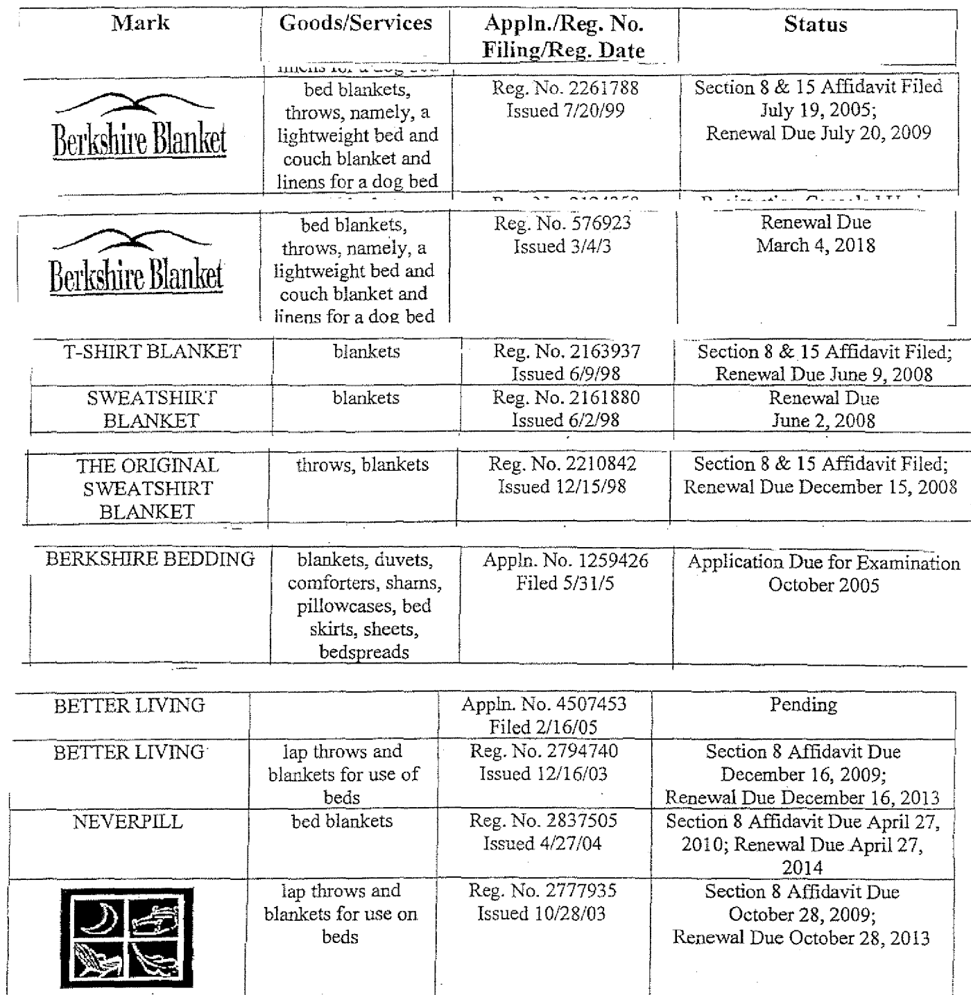
Exhibit A to Trademark Security Agreement