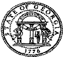
CATHY COX SECRETARY OF STATE