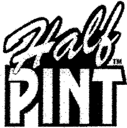
Half Pint Graphic