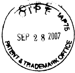
EXHIBIT "A" TRADEMARK

Description: Energy West Registration Number: 1923034 Registration Date: 09/26/1995 Serial Number: 74443205