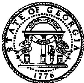
Karen C Handel Secretary of State

WITNESS my hand and official seal of the City of Atlanta and the State of Georgia on February 28, 2007