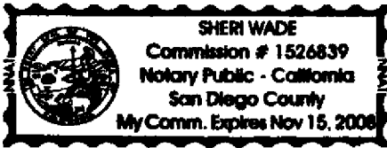
Place Notary Seal Above

Signature [Handwritten Signature] Signature of Notary Public