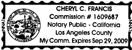
Place Notary Seal Above

Signature [Handwritten Signature] Signature of Notary Public