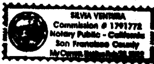
Place Notary Seal Above

Signature [Signature] Signature of Notary Public