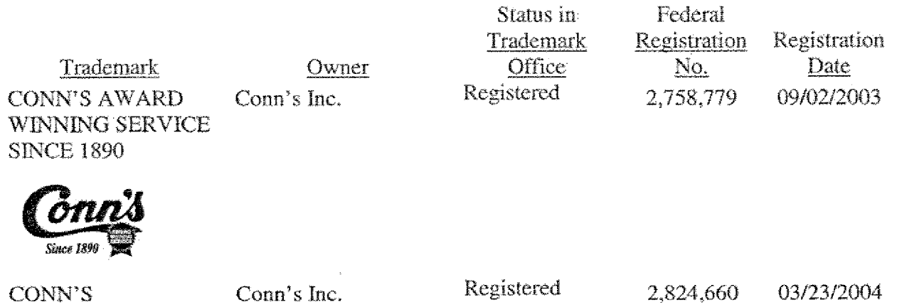
EXHIBIT A TRADEMARKS