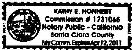
Place Notary Seal Above