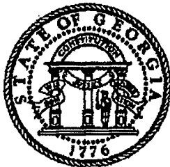
Karen C Handel Secretary of State

WITNESS my hand and official seal in the City of Atlanta and the State of Georgia on June 12, 2008