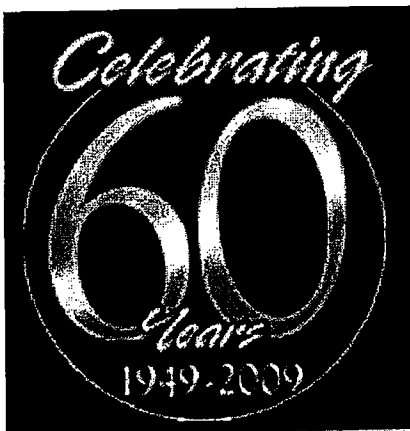
Van Dyke Design mark (formerly registered as U.S. Trademark Reg. No. 1400018)

VAN DYKE'S A TAXIDERMY TRADITION SINCE 1949