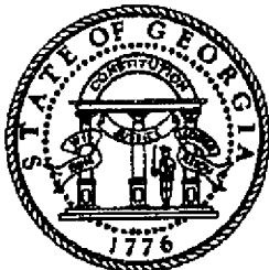
Karen C Handel Secretary of State

WITNESS my hand and official seal in the City of Atlanta , and the State of Georgia on March 3, 2009