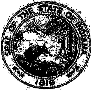
TODD ROKITA, SECRETARY OF STATE

In Witness Whereof, I have caused to be affixed the seal of the Secretary of the State of Indiana at the City of Indianapolis, November 18, 2010.