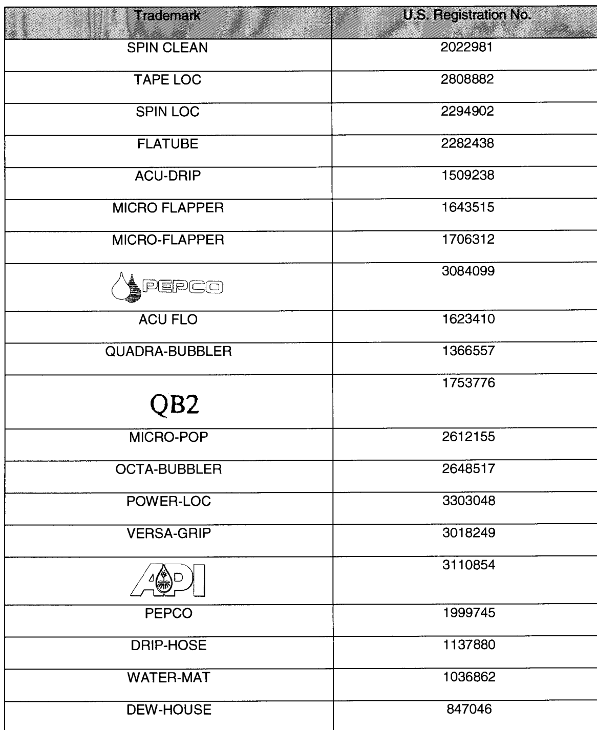
EXHIBIT A TRADEMARKS