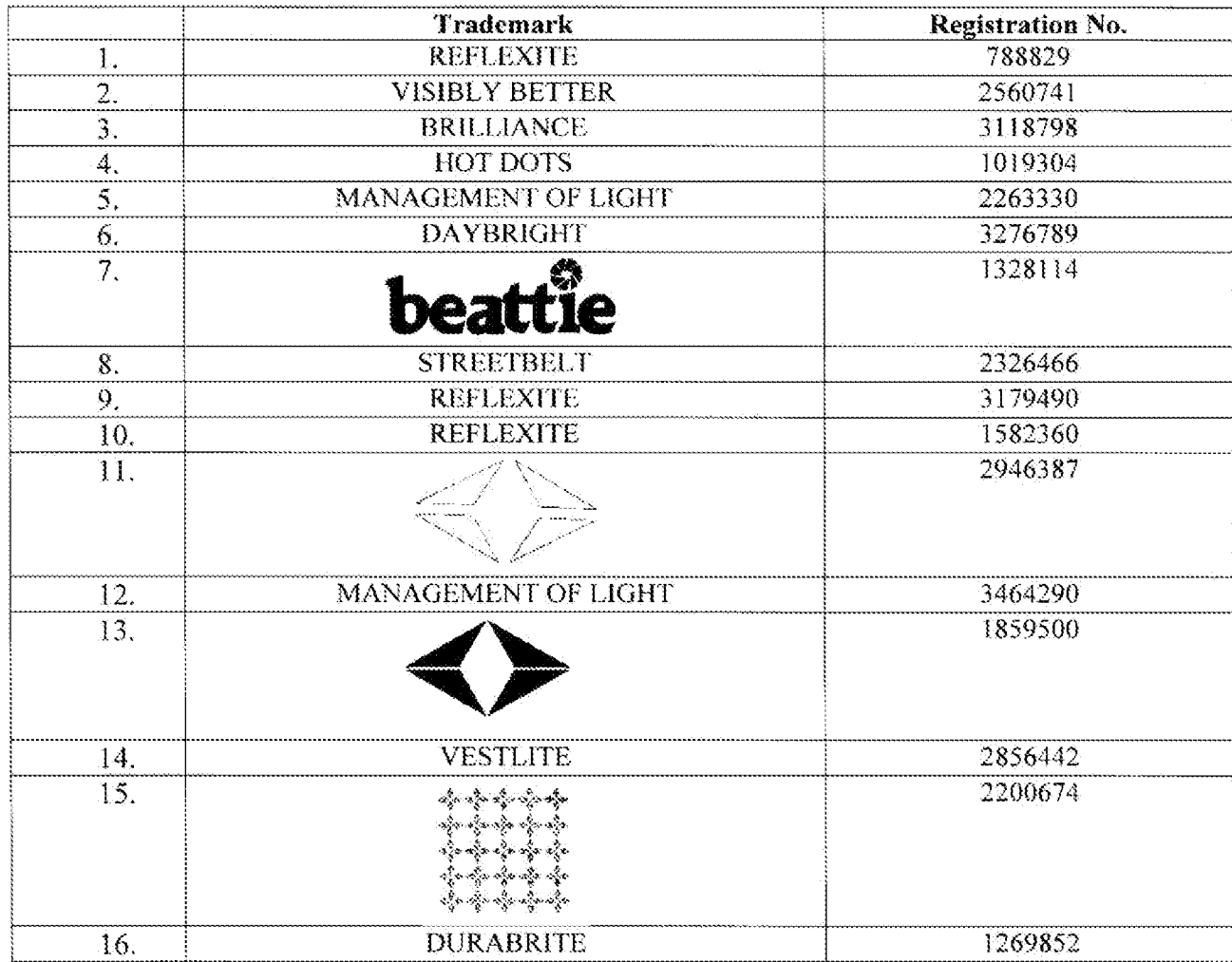
EXHIBIT B – Trademarks