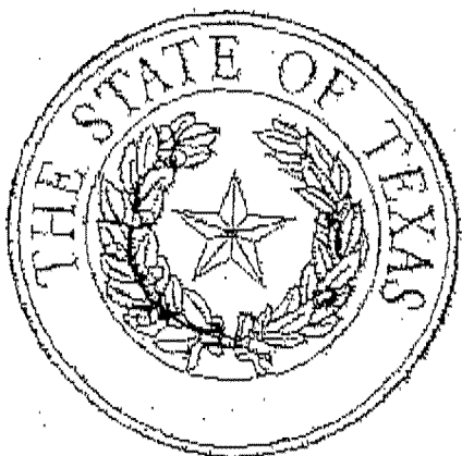
Roger Williams Secretary of State