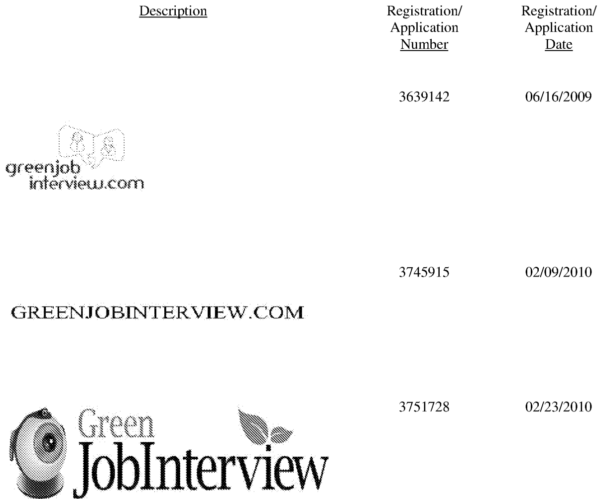
EXHIBIT C TRADEMARKS