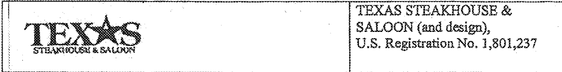
EXHIBIT A TO FEDERALLY REGISTERED SERVICE MARK ASSIGNMENT