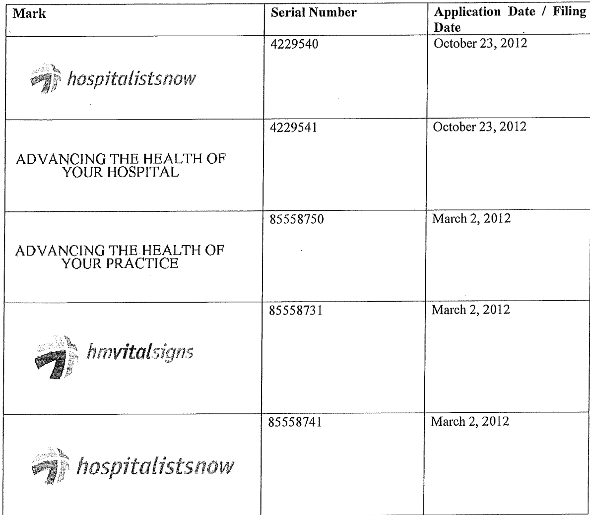
EXHIBIT C TRADEMARKS