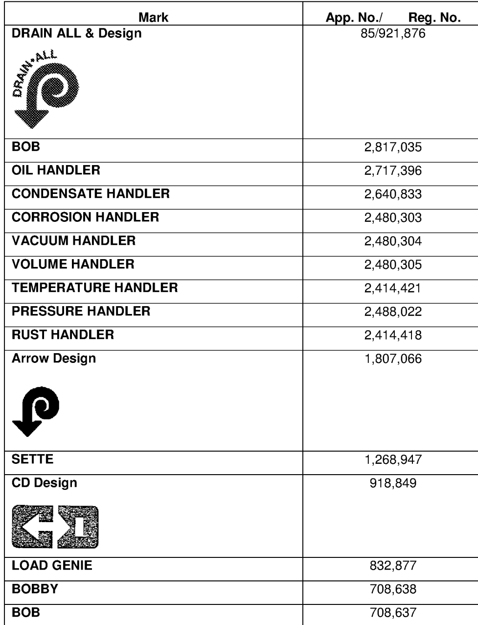
Exhibit A - SCHEDULE OF TRADEMARKS