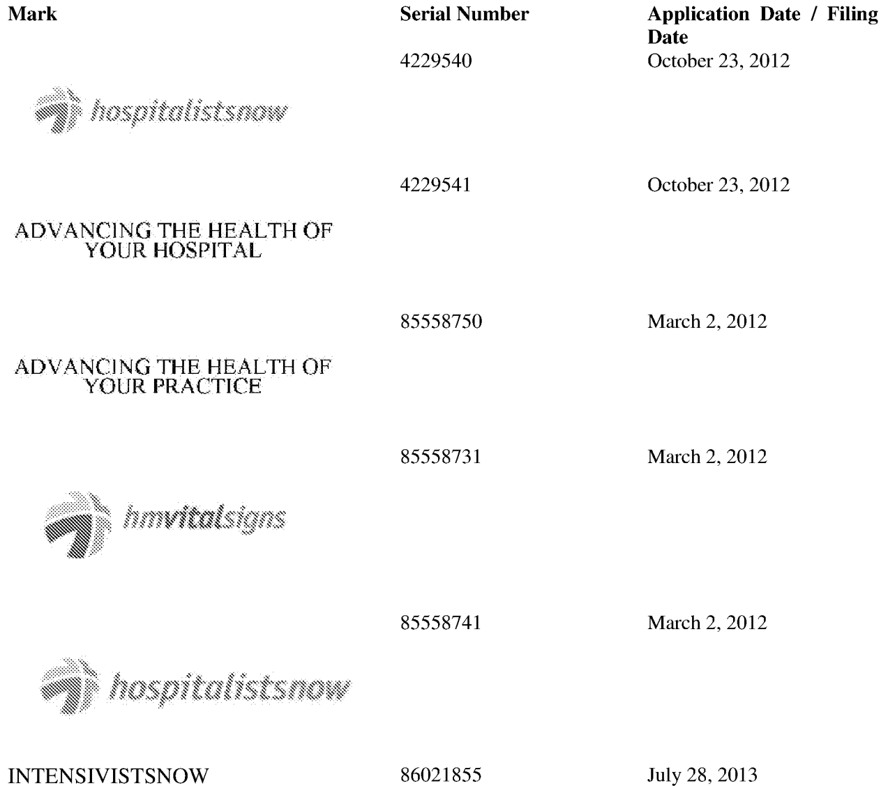
EXHIBIT C TRADEMARKS