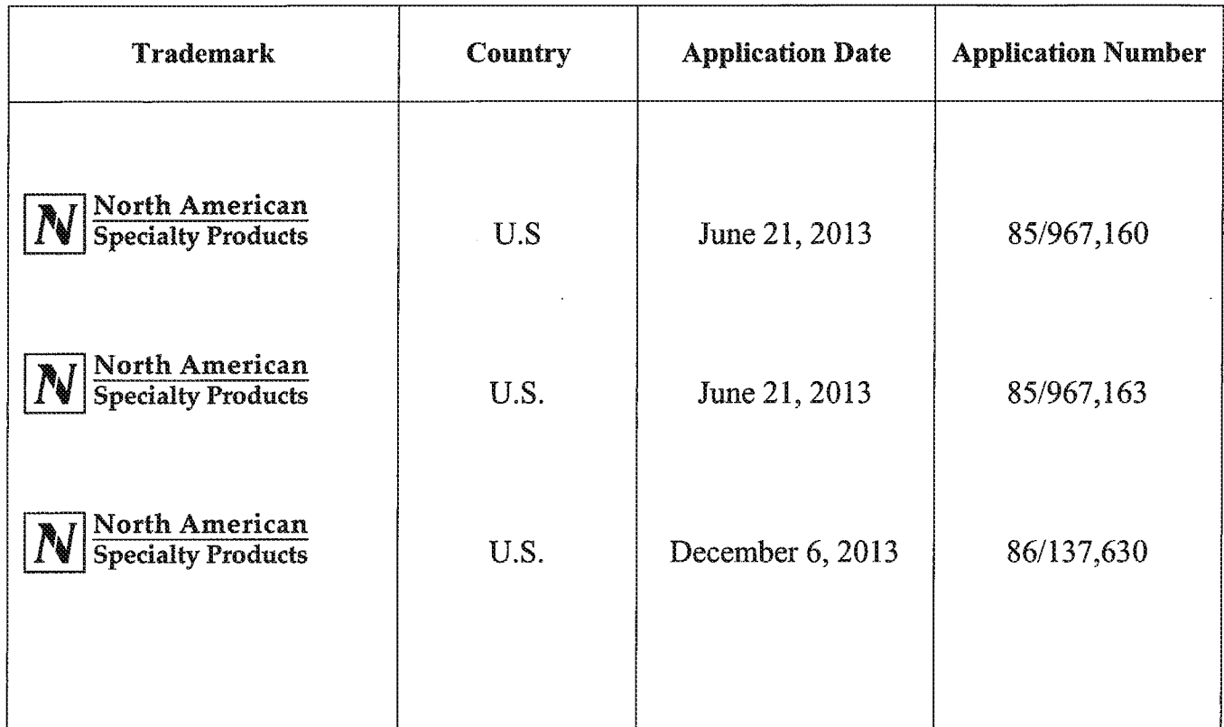
Exhibit – List of Assigned Trademarks