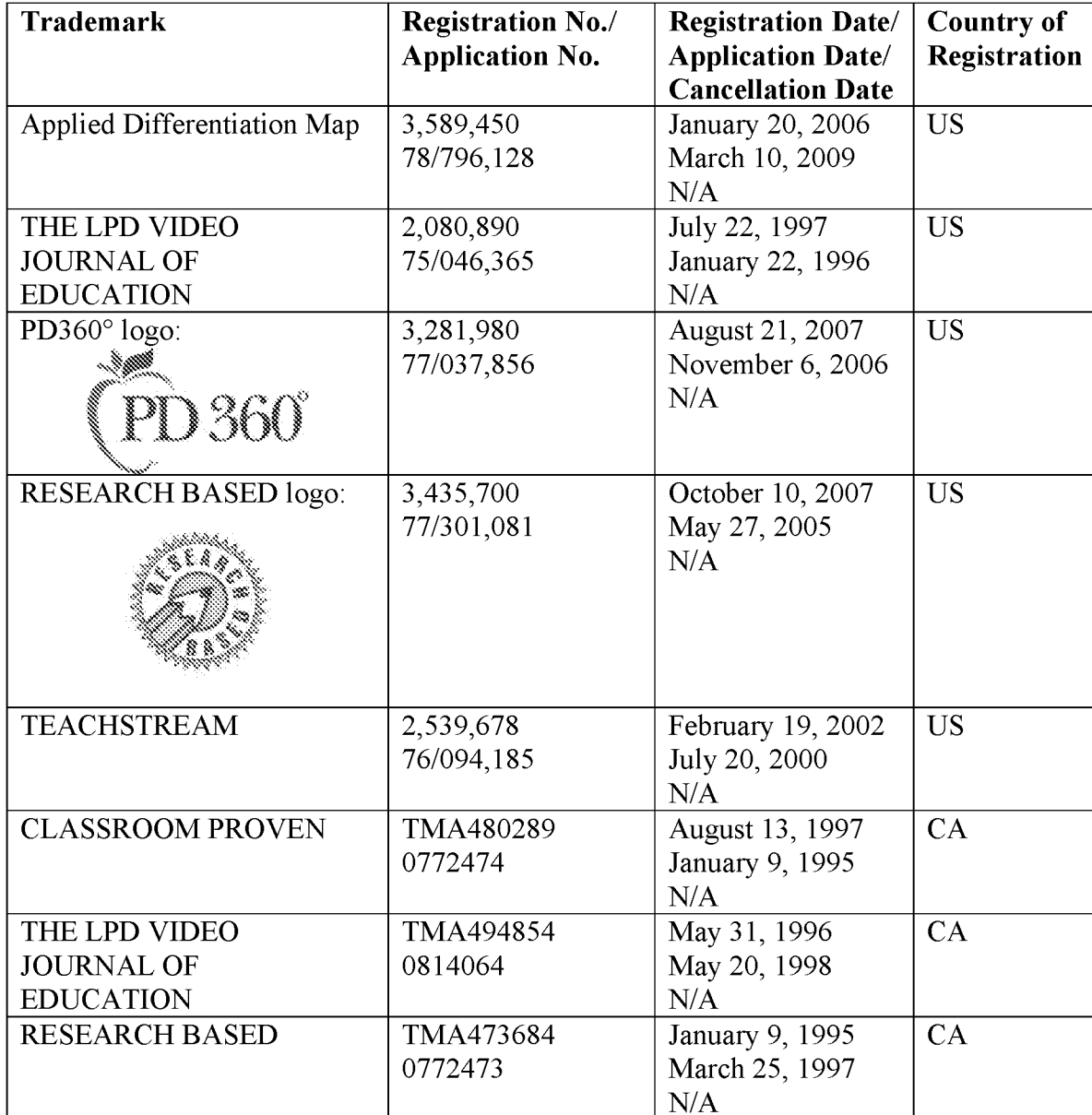
EXHIBIT TRADEMARK ASSIGNMENT TRICIP, INC., AND SCHOOL IMPROVEMENT NETWORK, LLC