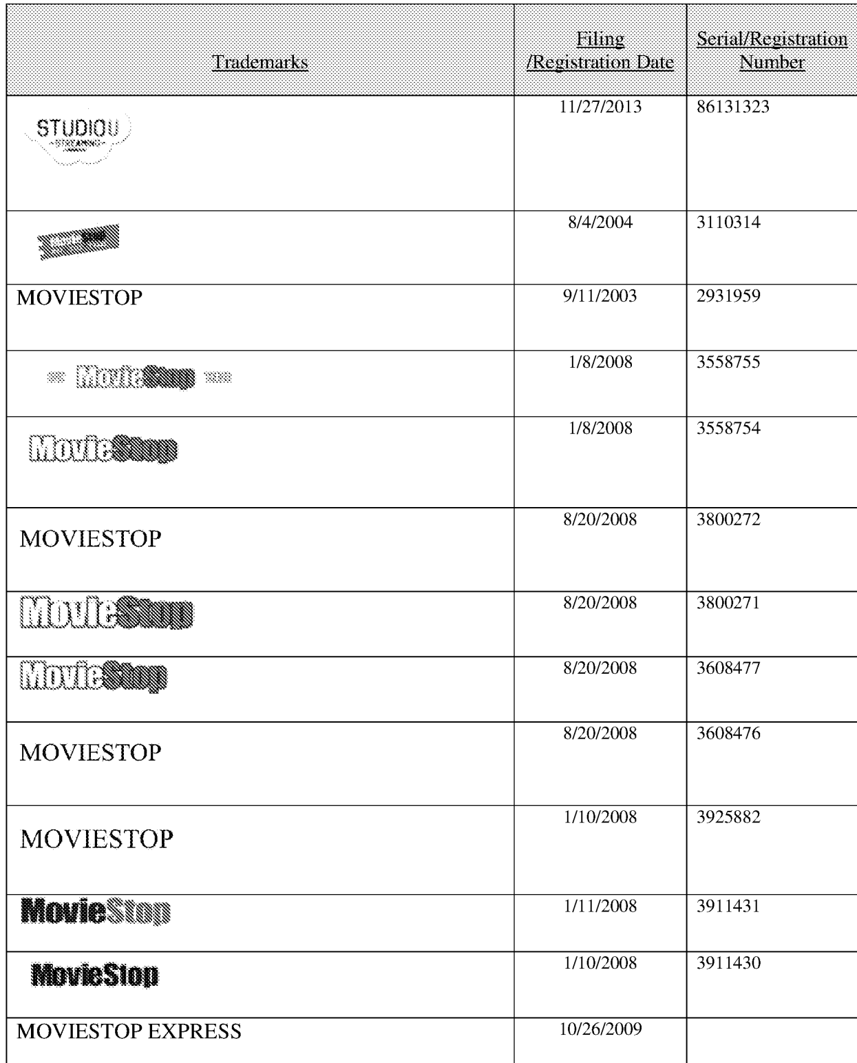
Exhibit A - Grant of Security Interest In U.S. Trademarks