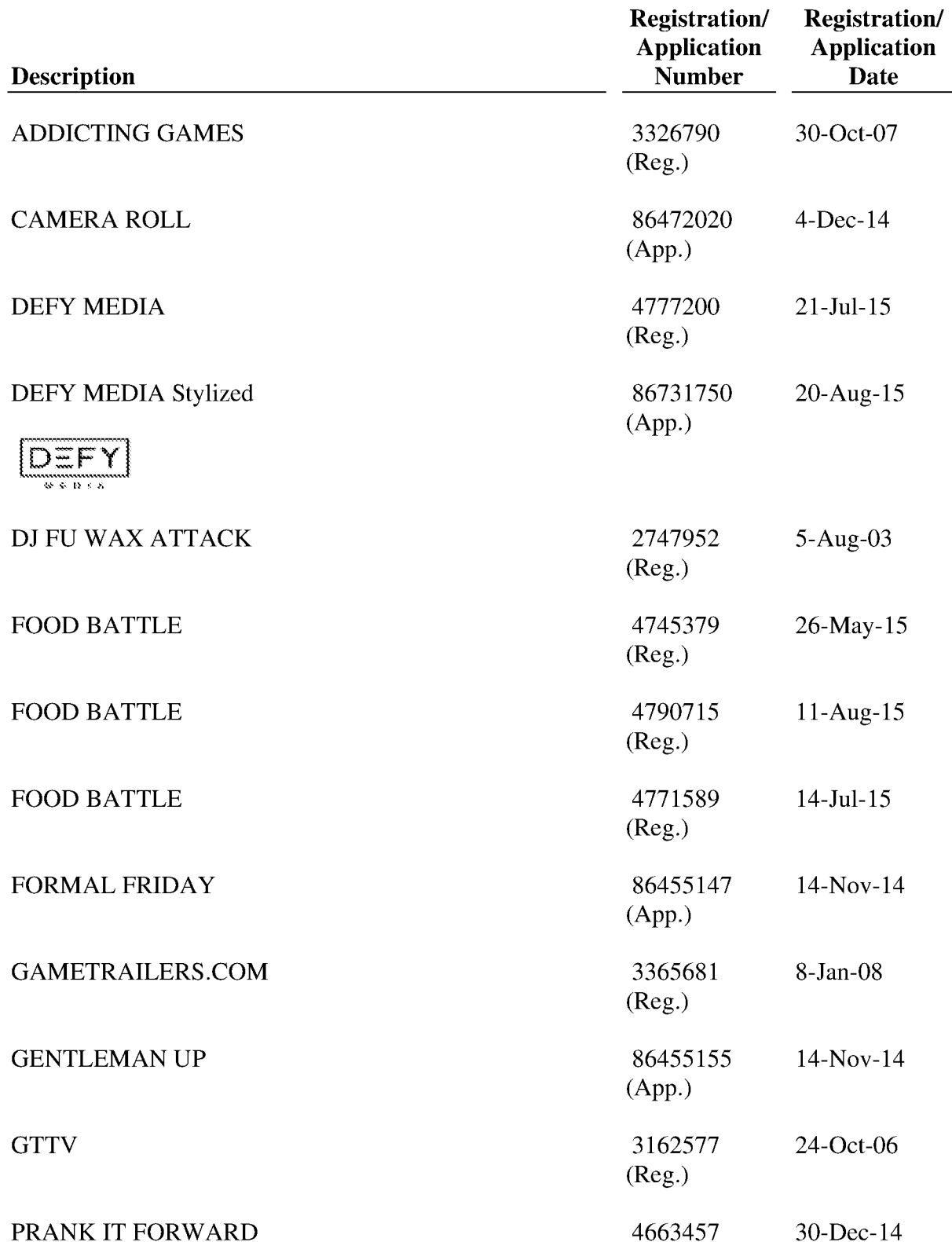
EXHIBIT C TRADEMARKS