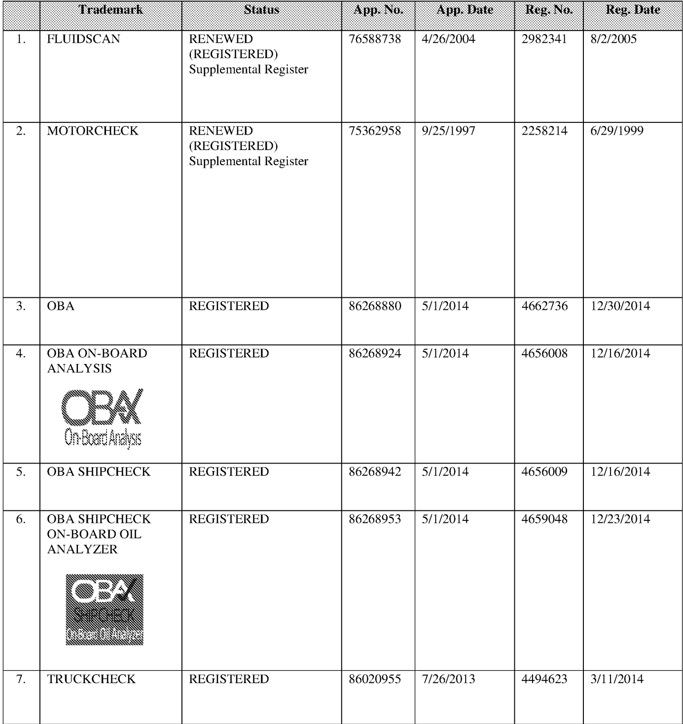
Exhibit A - SCHEDULE OF TRADEMARKS